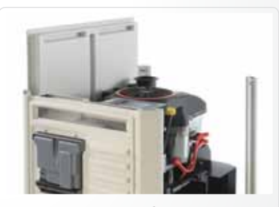
The roof and three sides on the CorePower 7 kW remove easily without tools.

All automatic standby generators perform a weekly self-diagnostic test to validate proper operation. Quieter than the competition, only Generac's patented, programmable Quiet-Test mode is ultra-quiet.